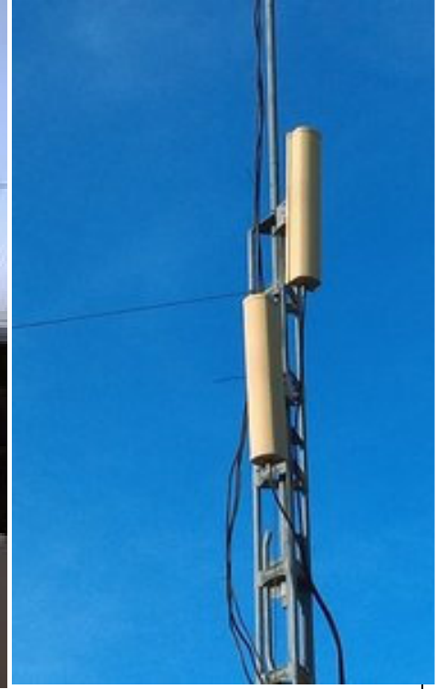
6 Sectors mounted at Base