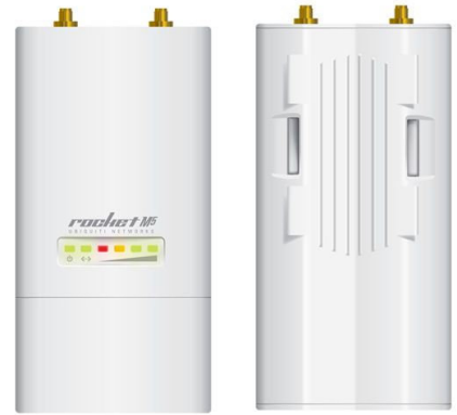
2 Rocket Radio