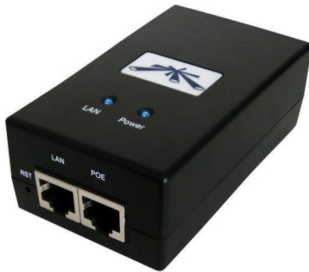
3 POE device *(may be included with Rocket)