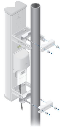
4 Mounting mast