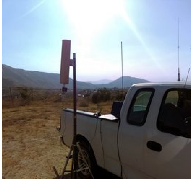
5 Sector used mobile